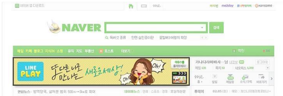
Fig. 3 Display Advertising: "Naver Ad Services." Naver 검색광고, Naver Corp,

Display Ads are where images or visual forms of advertising are displayed on common pages of Naver's search portal. The Time Board is a display ad that is considered premium due to its placement on Naver's front home page that can maximize attention. The Rolling Board is located on the right side of the front home page. The Mobile Banner Ad is displayed on the mobile platform of Naver's search portal. These forms of Display Ads can be customized to specific time periods or locations that can help target specific demographics, such as age, gender, and location ("Naver Ad Services").