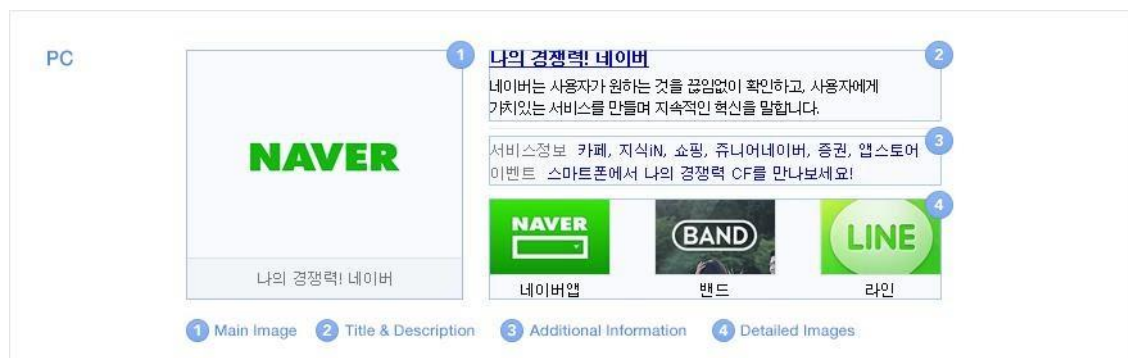
Fig. 2 Brand Search Advertising: "Naver Ad Services." Naver 검색광고, Naver Corp, https://saedu.naver.com/adguide/eng.naver .

Brand Search advertisements are content-based advertisements that are usually displayed with visual and supplemental elements along with the advertiser's brand or company. This form of advertising is common with most businesses to bolster their presence. Main image, description, titles, additional information and images, and links are commonly shown across the PC and mobile platforms ("Naver Ad Services").