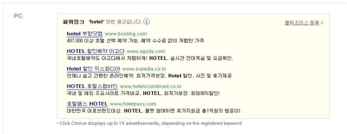
Fig. 1 Click Choice Advertising: "Naver Ad Services." Naver 검색광고, Naver Corp, https://saedu.naver.com/adguide/eng.naver .

Some types of Search Advertising include Click Choice, Brand Search, Display Ad, and Shopping Box. Click Choice advertisements are displayed on the Naver search results page where a yellow box with up to fifteen advertisement links depending on the searched keyword are displayed. These advertisements are displayed most frequently on both the PC and mobile forms of Naver's search engine service through Naver's ranking system that runs calculations on keywords to improve the quality index of advertisements and maintain their relevance. The cost of advertisements are calculated through the cost-per-click payment method that is based on the number of clicks received ("Naver Ad Services").